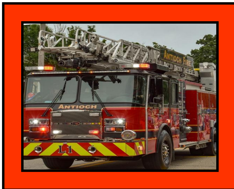
First Fire Protection District of Antioch - Fire Chief

The Fire Chief administers and manages all department rules, policies, regulations, and standard operating procedures; develops goals and assigns tasks to meet the department operational plan.